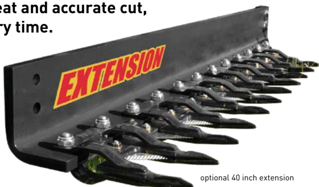
optional 40 inch extension