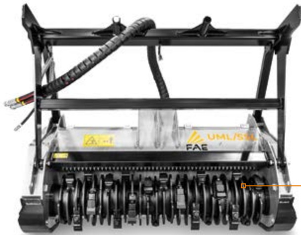
Rotor Bite Limiter